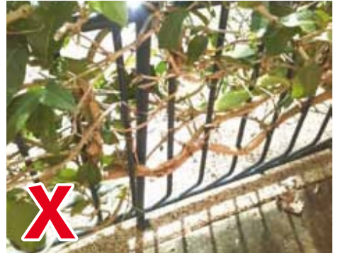
Vegetation that can be used to climb into the pool area should be removed.