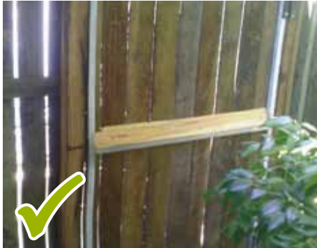
A minimum 60 degree angled wedge fillet along the horizontal rail eliminates a foothold.