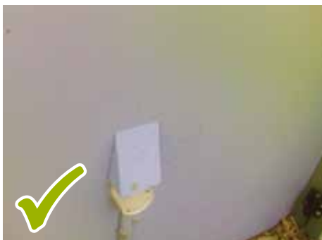
A power outlet has been shielded appropriately.