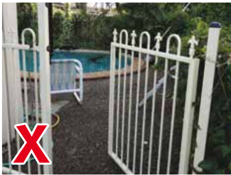
Inward opening gates must be modified to open outwards.