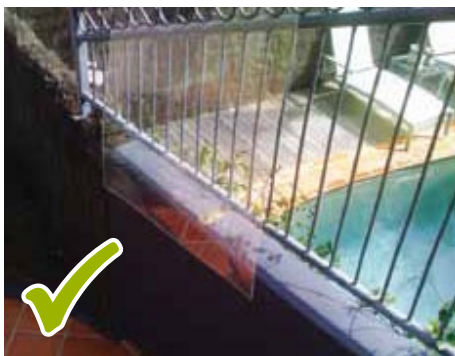
A flat polycarbonate sheet can be used to shield a climbable object.