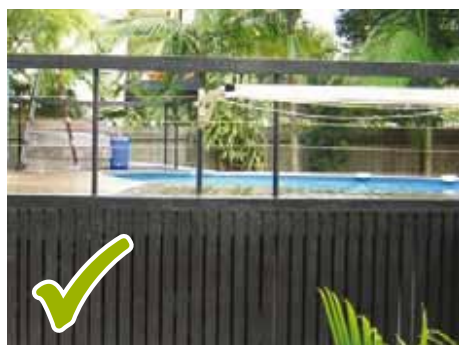
This deck bracing has been covered up with vertical palings less than 10 millimetres apart.