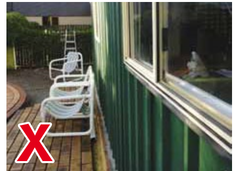
Windows that provide easy access to the pool area must be fixed permanently closed.