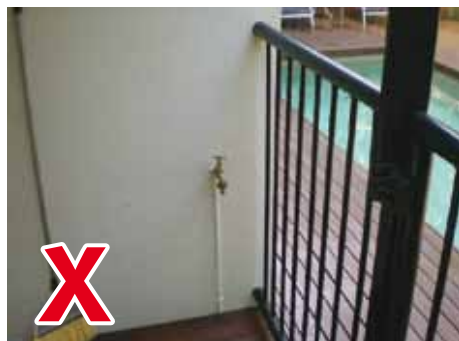
A tap fitting is a climbable object and must be shielded or removed.