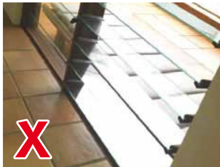
Louvres that create a gap of more than 100 millimetres do not comply.