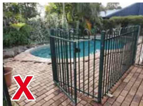
A gate cannot be tied or propped open when not in use and must self-close from any position.