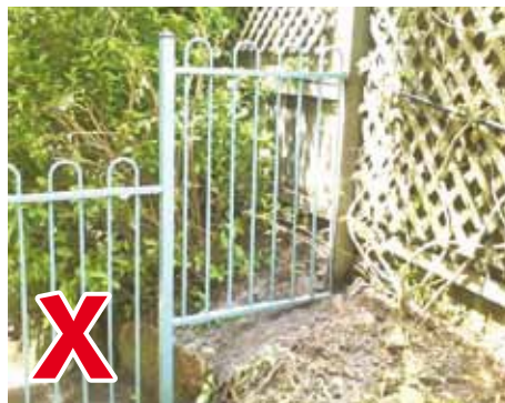
A high garden bed provides easy access to the pool area.

A pool barrier must be a minimum 1200 millimetres in height above the ground level. The ground level or garden beds surrounding the barrier may reduce this height if they have been raised or grown over time.