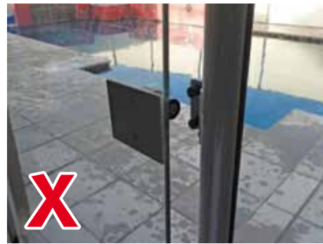
The gate or components may need to be adjusted or replaced to ensure the self-closing mechanism works properly.