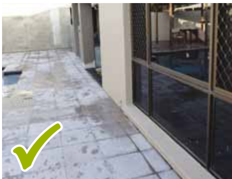
These windows have fixed security screens.